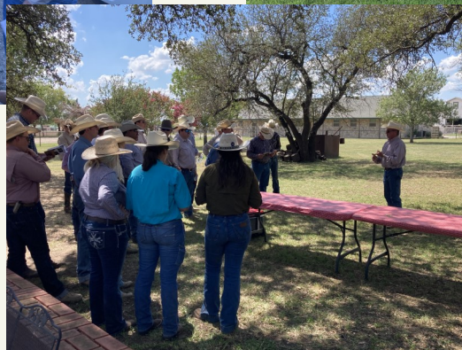
BONDS RANCH DAY TRIP