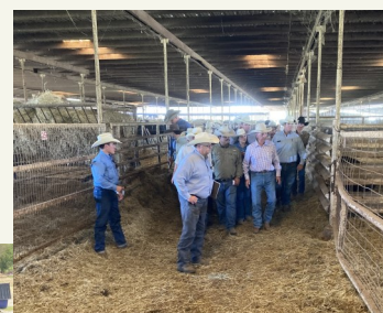
MONCRIEF RANCH and EC CATTLE DAY TRIP