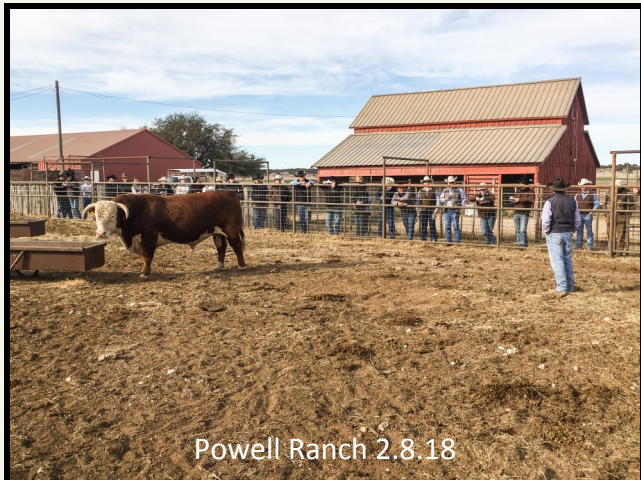
Powell Ranch 2.8.18