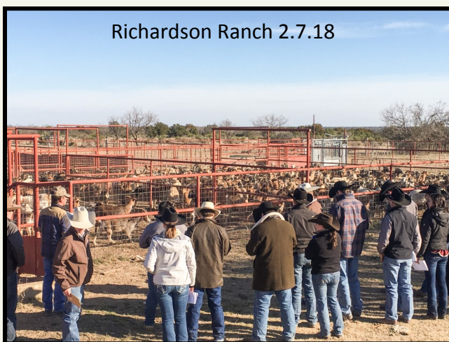
Richardson Ranch 2.7.18