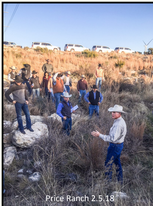
Price Ranch 2.5.18